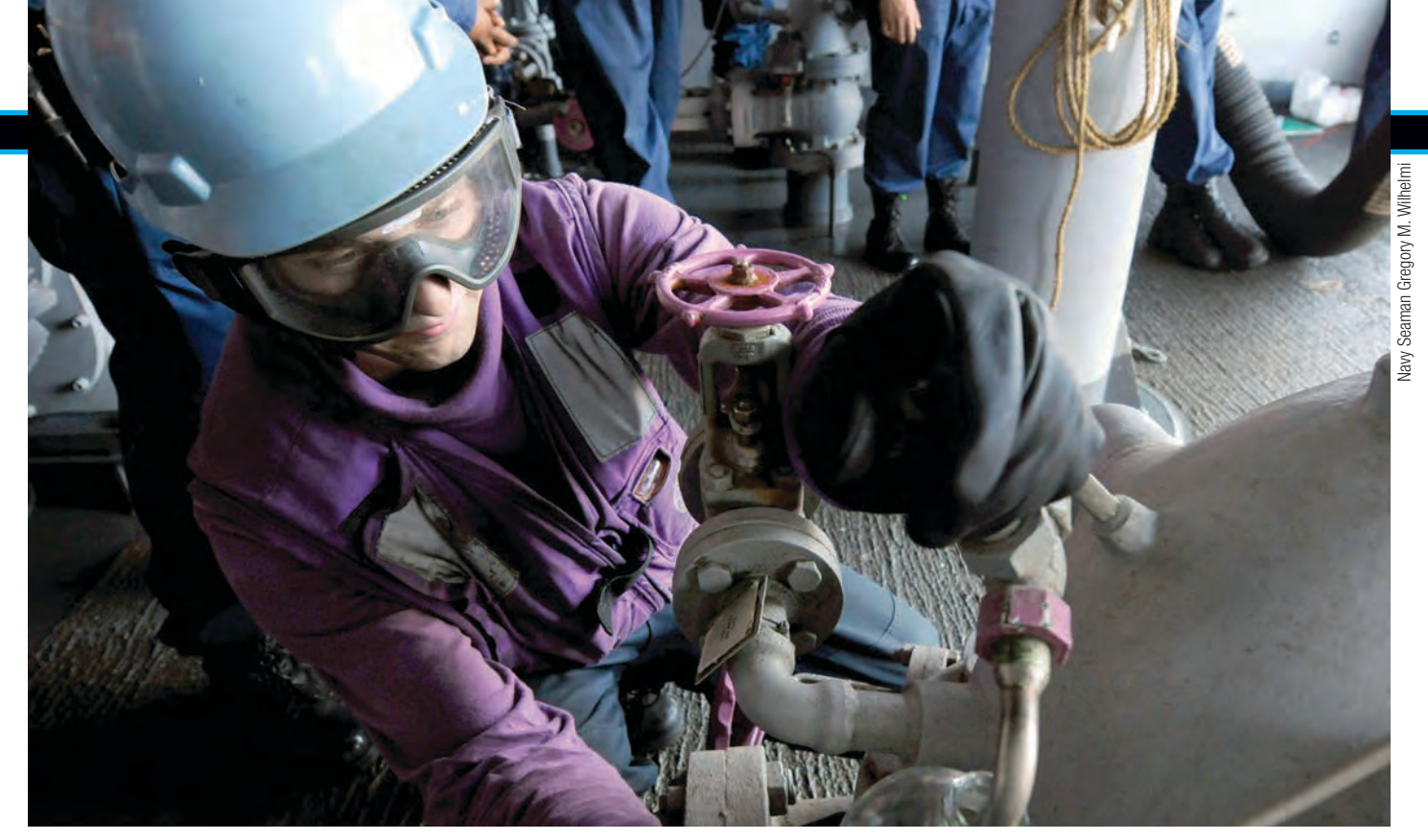
A Sailor gathers a fuel sample in a glass jar during an underway replenishment with the fleet replenishment oiler USNS Leroy Grumman in the Atlantic Ocean. Energy Convergence, a program under DLA's enterprise resource planning solution, is bringing all of DLA Energy's business processes into the Enterprise Buisness System.