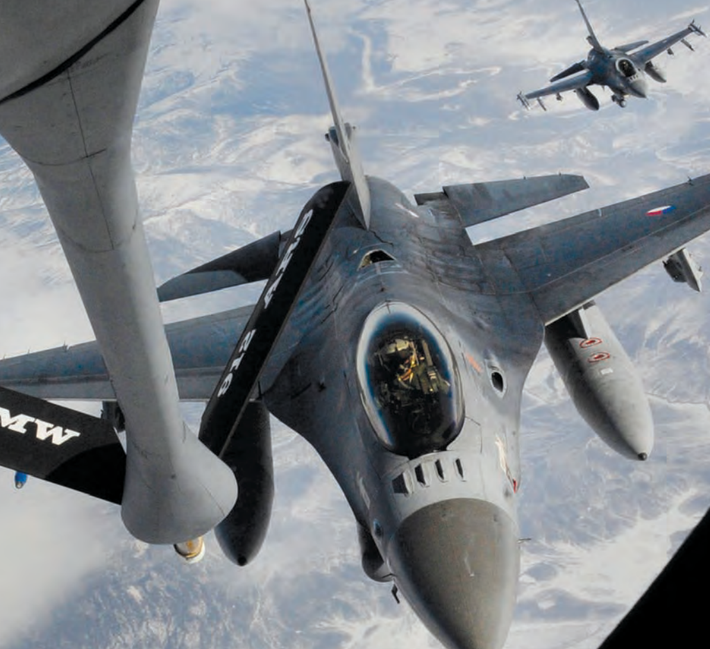
Acquisition support for alternative fuel used in aircraft and ships is a DLA priority.

disposal services. In Iraq, DLA will help ensure uninterrupted support for such commodities as food and fuel for the State Department, which assumed leadership of the U.S. presence there in October.