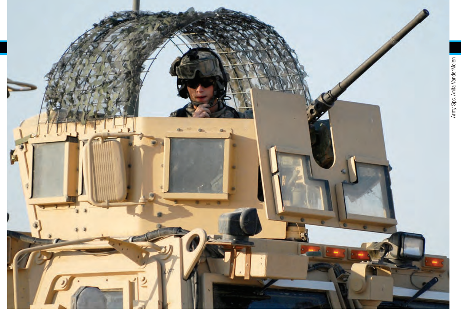
DLA Land and Maritime's strategic supplier alliance with BAE Systems helps ensure repair parts like those required for this Caiman Mine Resistant Ambush Protected vehicle are available when warfighters need them.