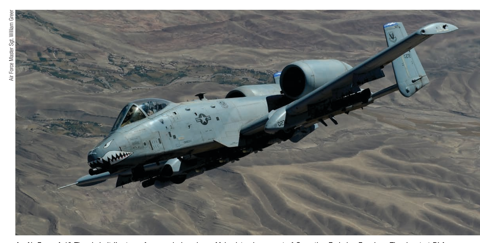
An Air Force A-10 Thunderbolt II returns from a mission above Afghanistan in support of Operation Enduring Freedom. The depot at DLA Distribution Hill, Utah, supports A-10 Thunderbolts, along with other aircraft and weapon systems, in its support of the Ogden Air Logistics Center.

Distribution mission," Konrady said. "We provide key distribution operations to include receiving, storage, packing, issue and shipping of Air Force weapons system spare parts to our local and colocated industrial customers."